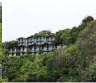
El Establo Nights 5-6