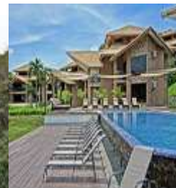
Nammbu Beachfront Bungalows Nights 7-8