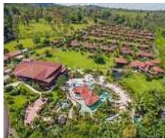
Arenal Springs Resort & Spa Nights 2-4