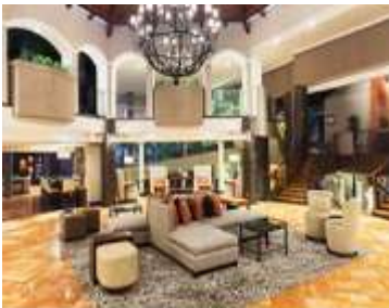
Doubletree Cariari Hotel Night 1

Day 9: Today you depart for home with fabulous memories of your Costa Rican adventure.