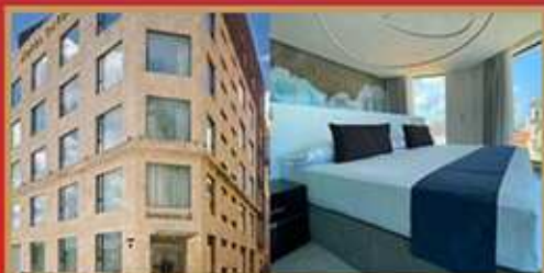
Days 1 through 4 – Meliá Catedral, Havana, Cuba