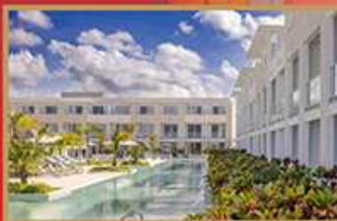
Days 5 and 6 – Meliá Peninsula, Trinidad, Cuba

Call 321-594-0392 to Book with a Deposit Travel Insurance Recommended Tours are Non- Refundable