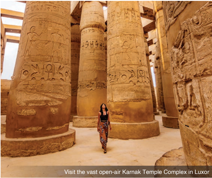
Visit the vast open-air Karnak Temple Complex in Luxor