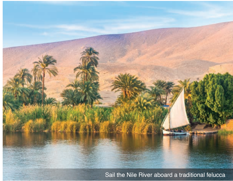
Sail the Nile River aboard a traditional felucca

DAY 1 Depart the USA: Depart the USA on your transatlantic overnight flight to Cairo, Egypt.