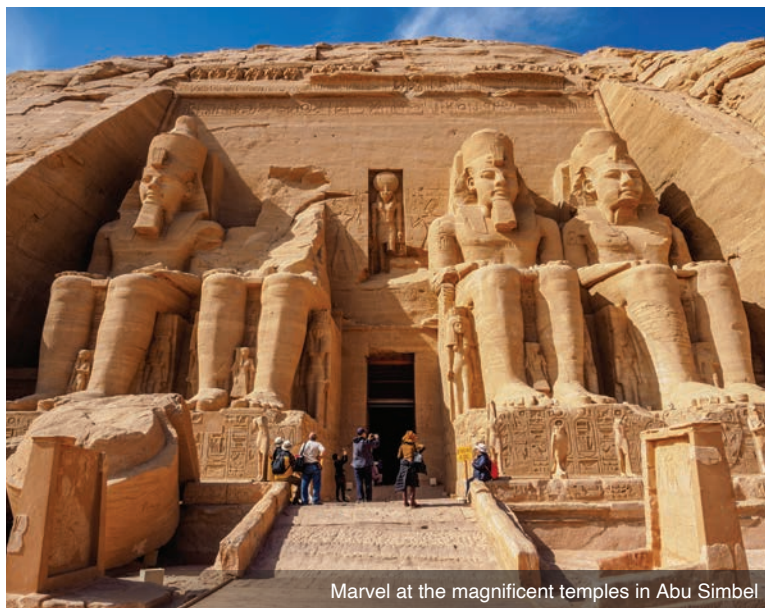
Marvel at the magnificent temples in Abu Simbel

Egypt, but it is the second largest after Karnak. In the afternoon, sail to Kom Ombo, a pleasant agricultural town and home to many Nubians. Enjoy a cooking class onboard as you sail to the next port. Upon arrival, visit the unusual Temple of Kom Ombo dedicated to both Horus and the crocodile god Sobek. After re-embarking, the ship sails for Aswan. Relax on the Sun Deck as you cruise along the Nile. Meals: B, L, D