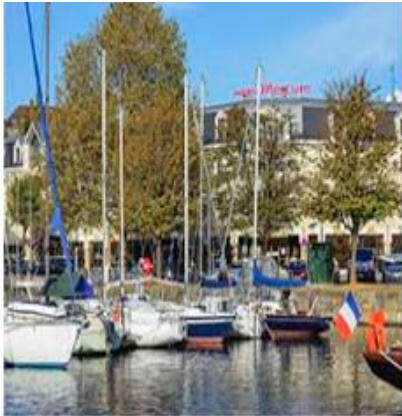
Mercure Caen City Center-Port de Plaisance