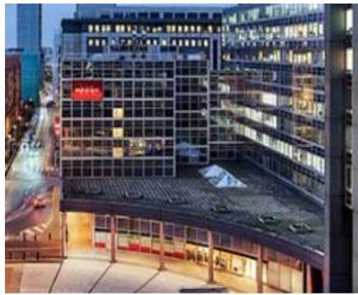
Renaissance La Defense