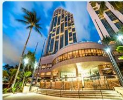
Prince Waikiki Nights 1-3

Pre Night: Prince Waikiki From $165 per night