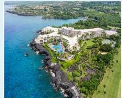
Outrigger Kona Resort and Spa Nights 4-6