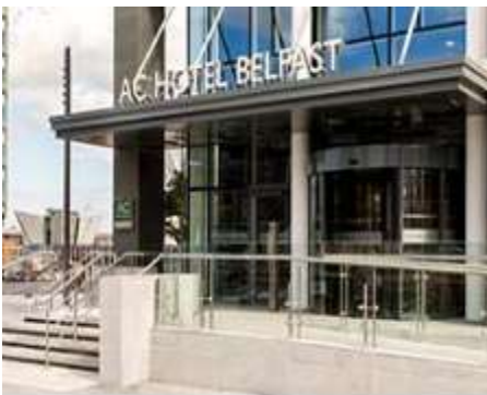
AC Hotel by Marriott Belfast Nights 6-7