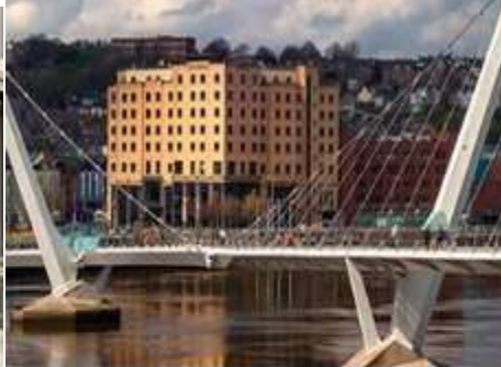
City Hotel Derry Nights 8-9