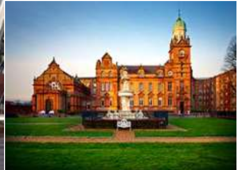
Clayton Hotel Ballsbridge Nights 10-11