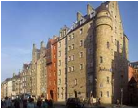
Radisson Blu Edinburgh Nights 1-2