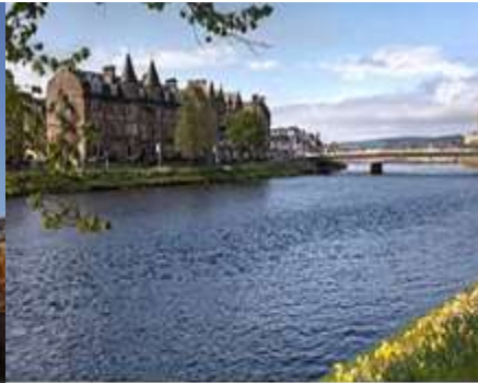
Best Western Palace Hotel Inverness Nights 3-4