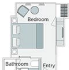
Emerald Stateroom 153ft 2 - 170ft 2