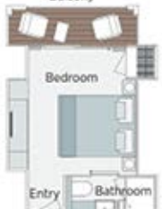
Grand Balcony Suite 207ft 2 - 210ft 2