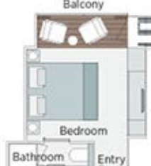
Emerald Panorama Balcony Suite 160ft 2 - 189ft 2