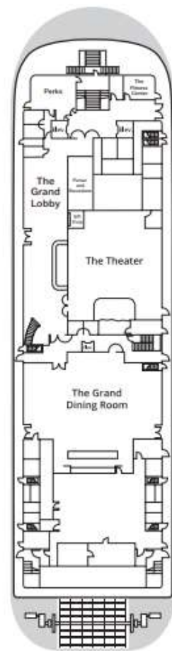
DECK 1 MAIN DECK Perks The Fitness Center The Grand Lobby The Theater The Grand Dining Room Purser & Excursions Desk