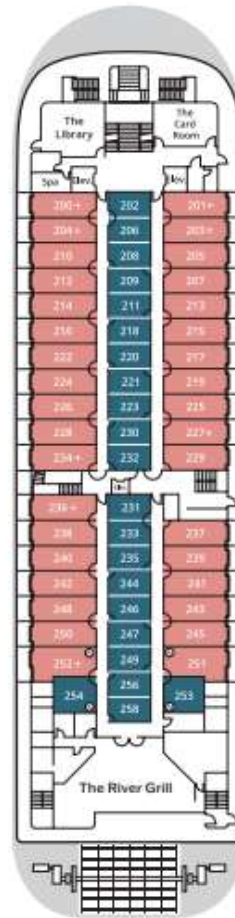
DECK 2 CABIN DECK The Library The Card Room Spa The River Grill Staterooms