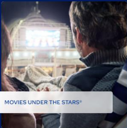
MOVIES UNDER THE STARS®