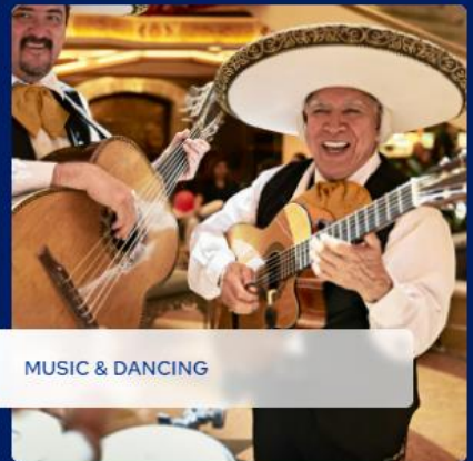
MUSIC & DANCING