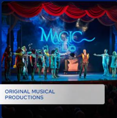
ORIGINAL MUSICAL PRODUCTIONS