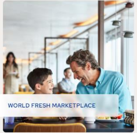
WORLD FRESH MARKETPLACE