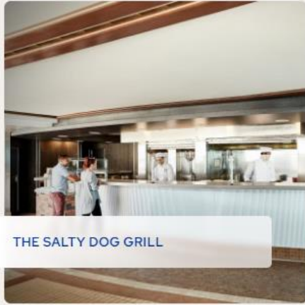
THE SALTY DOG GRILL