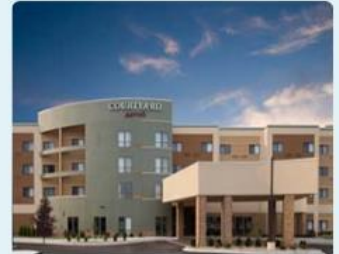
Courtyard Bay City Night 6