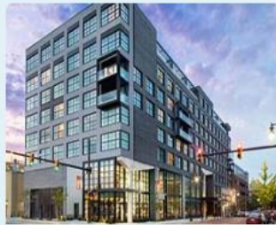
Canopy by Hilton Grand Rapids Downtown Night 3