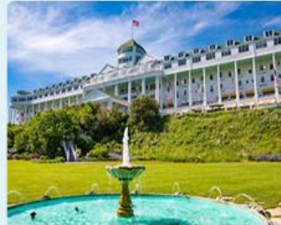
Grand Hotel Nights 4-5