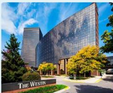
Westin Hotel Southfield Detroit Nights 7-8