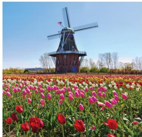
9 Days • 13 Meals: 8 Breakfasts, 1 Lunch, 4 Dinners

HIGHLIGHTS... Chicago, Millenium Park, Holland's Tulip Time Festival, Mackinac Island, Grand Hotel, Frankenmuth, Henry Ford Museum & Greenfield Village