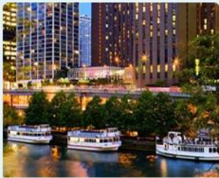
Hyatt Regency Chicago Nights 1-2