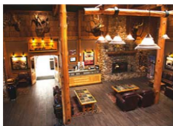
Best Western PLUS Bryce Canyon Grand Hotel