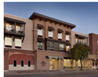
Homewood Suites by Hilton Moab