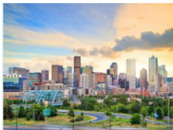
Grand Hyatt Denver

Day 10: Tuesday, October 19, 2027 Las Vegas - Tour Ends Say goodbye to Las Vegas and the painted canyons of the west as you depart for home.