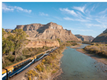
Canyon Spirit RailTours